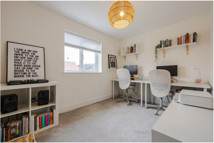
Bedroom Three 8'2" x 11'2" (2.49 x 3.41)