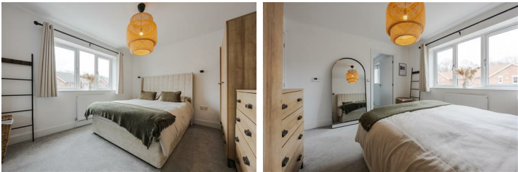
Bedroom One 10'9" x 11'9" (3.29 x 3.60)